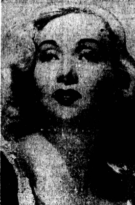
GETS FIRST '48 DIVORCE