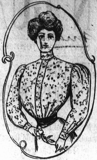
EMBROIDERED LINEN SHIRT WAIST.