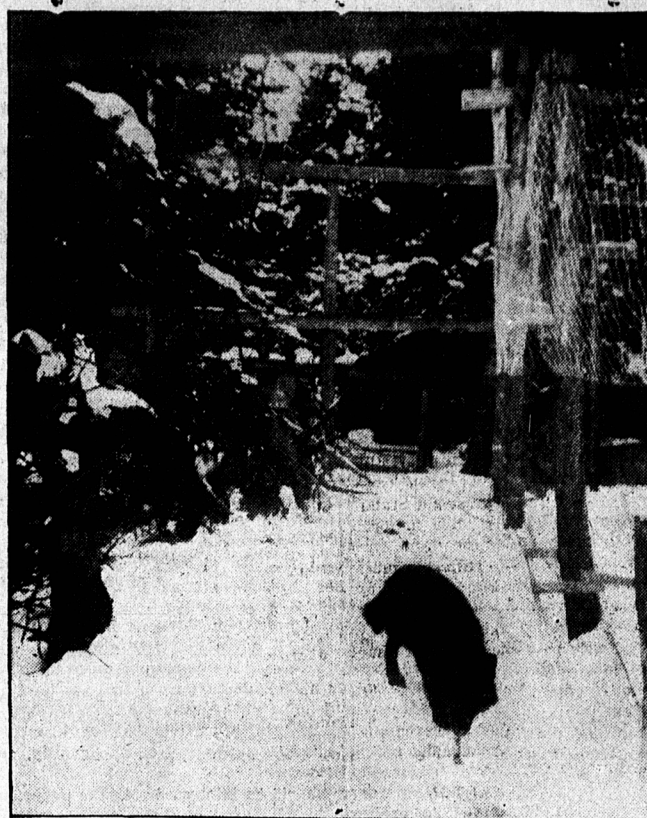
A WINTER SCENE IN A FOX RANCH WITH REYNARD IN THE FOREGROUND.

THE GARDEN OF THE GULF ITS MEN OF ACTION AND ITS RESOURCES