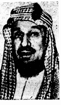
King Ibn Saud of Saudi Arabia has declared that Arabs are "prepared to sacrifice blood for Palestine." Arabs demonstrated their disagreement with the U. N. Palestine committee's partition plan by parades and storming of legation residences in the Near East.

about 550 per cent did so at once. About 26 per cent stopped after a few relapses. Most of the other members have improved. Alcoholics Anonymous is a synthetic idea embodying nothing new. It has adopted wholly the principles of both medicine and religion. But the members, as healed have one great advantage. They are drinkers who have recovered. A drunkard meeting one of the A. A. members for the first time in years the first time he feels safe. This the spokesman declared, is the advantage that the A. A. members have over doctors and clergymen. The wets solemnly predict that the legislation of liquor would bring financial and social benefits to the nation, after more than ten years of legalized drunkenness we now have: 1. The highest rate of juvenile delinquency in our history. 2. The greatest period of crime in the history of the nation. 3. Venereal diseases so frightful in their prevalence that our foremost health and medical authorities refer to one of them, syphilis, as Public Health Problem No. 1. 4. Jails, penitentiaries, and asylums more crowded than ever before. 5. Traffic fatalities more terrible than the statistics of American deaths in battle. 6. The highest tax rate on record. 7. The largest public debt in the