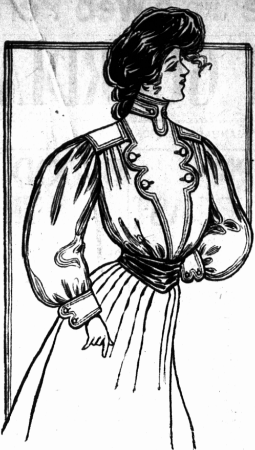
A nobby shirt waist of white linen, trimmed in stitching and fancy white pearl buttons.