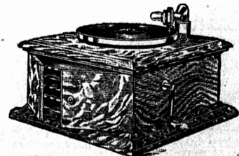
Victor-Victrola IV, $20 Oak