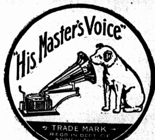
The Best Known Trade Mark in the World.

A chance to save money on men's cloth leggings—$1.50 now $1.15