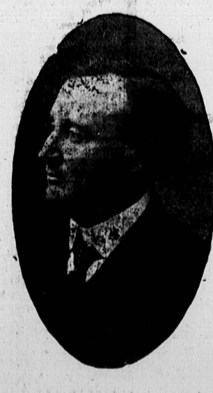
Hon. J. J. Johnston, Ex-Attorney General, adopted as the Liberal candidate for King's County in the coming Federal Election.

**Ham, tongue, lamb, beef, pickles, salads, buttered bread, cake, biscuits, cheese, tea served in Exhibition Building by the Ladies Aid of Hospital. Also candy and fancy table.