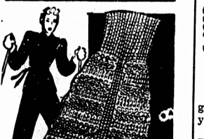
DESIGN NO. 385

Design No. 385 Knitted socks for sports or bed are so easy to make. Ideal for the teenager. Pattern No. 385 contains complete instructions. Needlework Book 20 cents. To order: Send 20 cents in coin to Needlework Bureau, Charlotte-town Guardian, Design No. 385