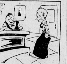
"The old Vikings used to hit the horn pretty lively." "Yes, whenever they went on a toot."