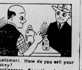
Customer: How do you sell your whiskey? Bootlegger: Secretly, of course.