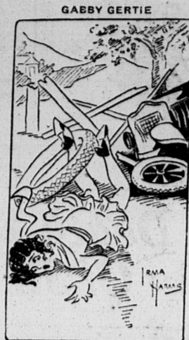
"The girl who travels on her face eventually wears out her ticket."