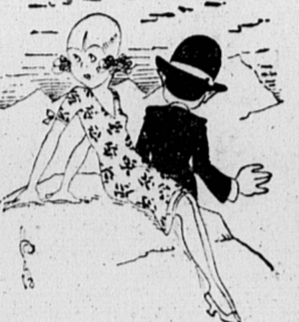
He: Isn't the view gorgeous here? She: I never knew of a fellow being interested in the view on his honeymoon.