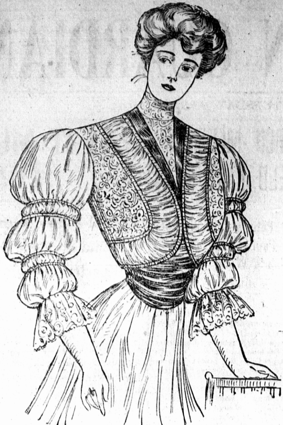
SMART BOLERO BLOUSE.

Mark Wright Furnishing Co., "Always the Best Value in the City."