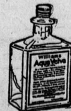
Williams Aqua Velva

Then a few drops of tingling Aqua Velva—just to keep it soft and smooth as Williams Shaving Cream leaves it. There's the perfect shave—the perfect after-shave.