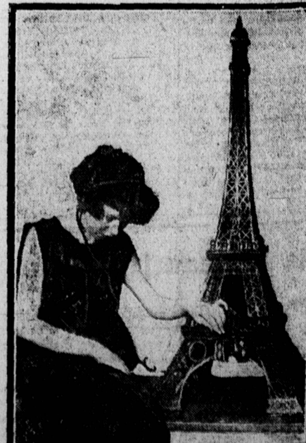
This complete receiving set, built by an amateur, is an exact model of the Eiffel Tower in Paris. The radio set of the future will probably be one which will add to the beauty of the home