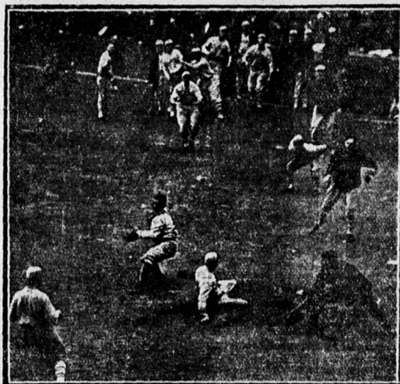
Stengel's fellow-players rushed out from their dug-out to congratulate him when he scored the winning run for the New York Giants in the first game of the world's series