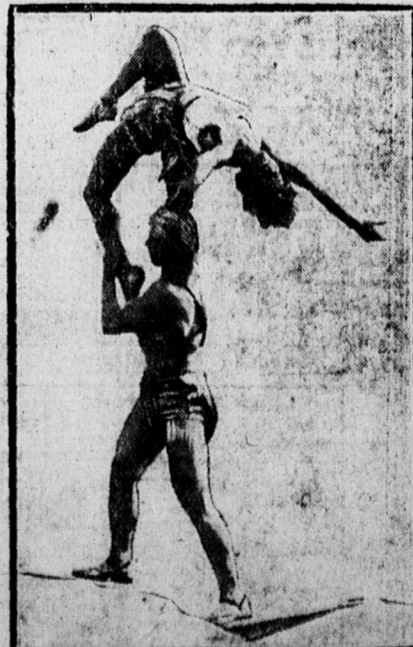
Renoli and Renova, well-known Russian ballet dancers, are seen doing a daredevil stunt atop a lifeboat on an ocean liner while onlookers gasp with amazement.