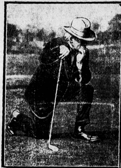
To putt or not to putt—that is the question. Lloyd George is seen indulging in a game of golf at Montreal for the first time since his arrival on the continent