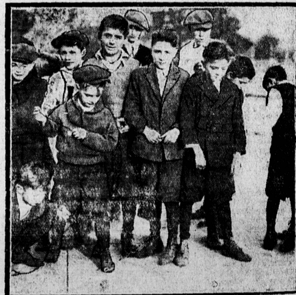
A top contest is seen in full swing in a city park in which boys and girls take part. The struggle for the championship is keen, and every day after school a large crowd gathers to watch the contest