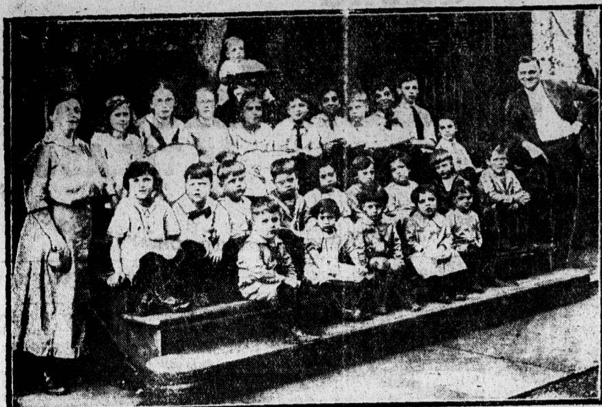
This family of twenty-five children are put to bed and are served at meals in shifts. They have all been adopted by the couple shown in the photograph who care for them without help