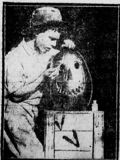
Young Canadians are preparing already for the big Halloween party. This farmer's boy is carving a face in a pumpkin which he will carry about on the night of nights