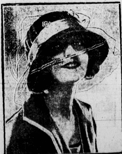
This "Cupid" hat shows the gathered crown and small rim, with maline acting as both a veil and a trimming. Gold metallic ribbon encircles the crown