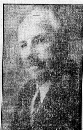
Hon. B. W. LePage, Lieut.-Governor.