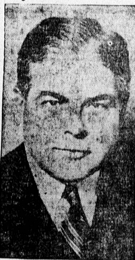
Sir Edward Beatty, G.B.E., K.C., LL.D., Vice-Chairman.