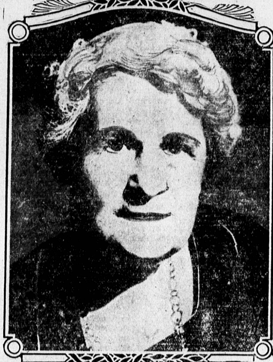
REVEALS SECRET AFTER YEARS OF SILENCE