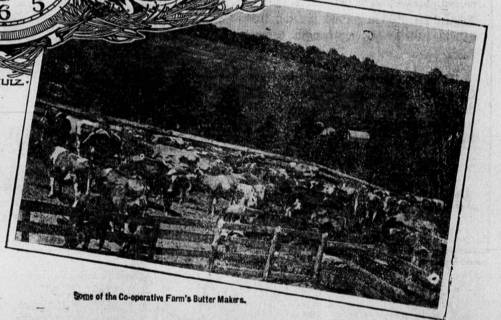
Some of the Co-operative Farm's Butter Makers.