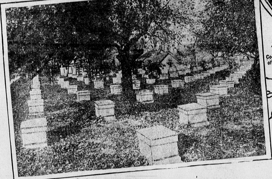
Bee Farm in Monmouth County Which Will Furnish 5,000 Pounds of Honey.