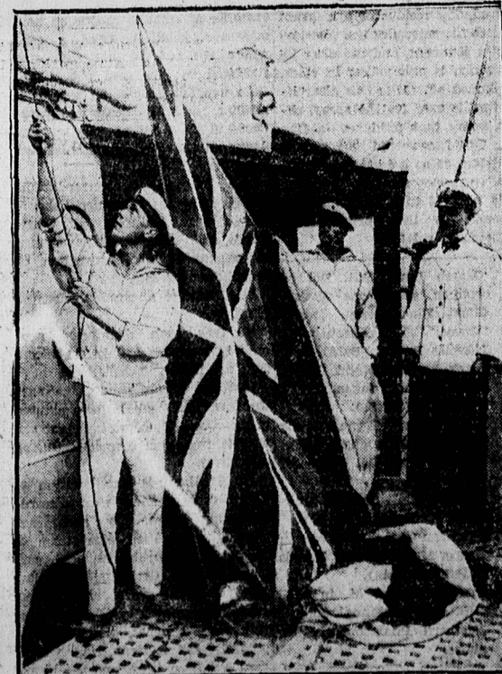
SAILORS WELCOMED BY GERMAN PEOPLE

Miss Betty Nuthall, famous English tennis star, walks off the court at Wimbledon, England, not a bit downcast after being beaten, recently, by Helen Jacobs.