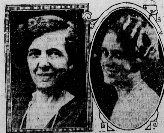
ARTICLE EFFECTS MOTHER-DAUGHTER REUNION

Horseman's hip of rare ability was demonstrated recently by members of 5th Inniskilling Dragoons during a rehearsal for the Aldershot command horse show at Aldershot, England. These daring equestrians show you how easy it is if you know how. These Dragoons are said to be one of the best trained bodies of the kind.