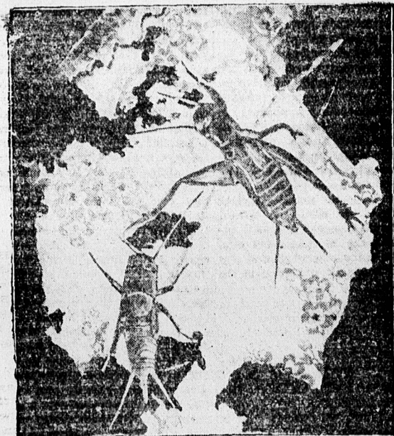
SWANSEA RESIDENTS VICTIMS OF CRICKET PLAGUE

Feature of recent Calgary stampede was the chuck wagon race seen here. All cowboys know chuck wagon is the cook pantry on wheels. In it are stowed food, pots and pans, camp stove and what have you. Many of these wagons are still in use among ranches in Alberta and other sections of Western Canada.