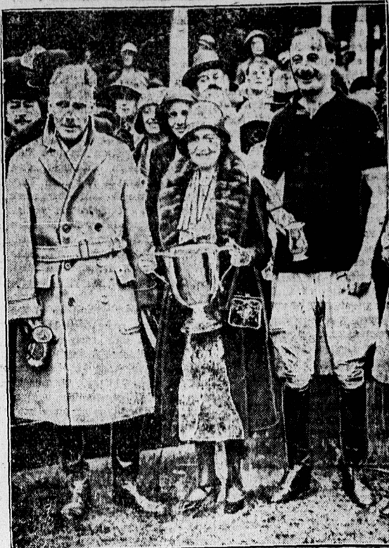
WIFE OF HIGH COMMISSIONER PRESENTS TROPHY