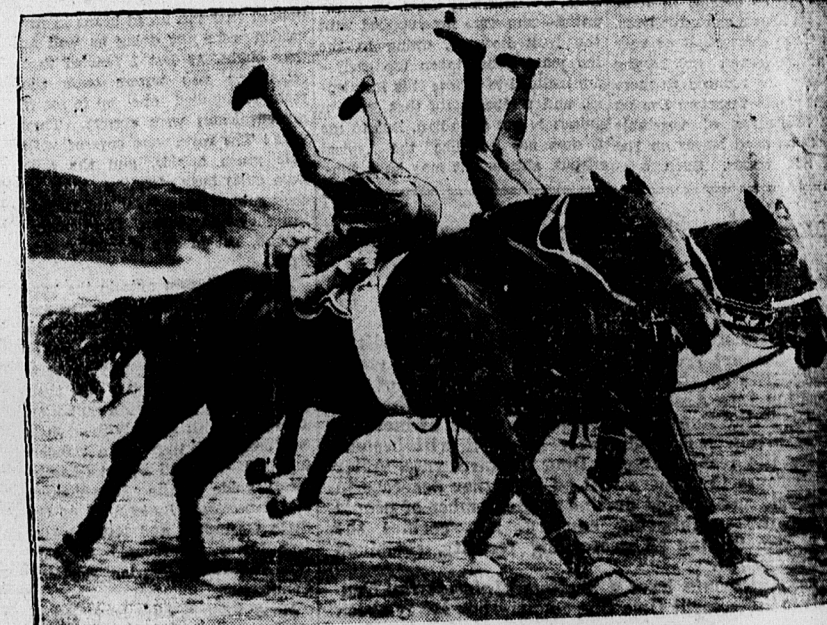
DRAGOONS SHOW SKILL AND ABILITY AT ALDERSHOT

Kiel, once the proud port of the German navy, gave a thrilling reception to the British cruisers "Devonshire" and "Norfolk," the British warships, which are the first to visit Kiel since the war. The ABOVE photo shows the British flag being hoisted on the German ship Schleswig-Holstein.