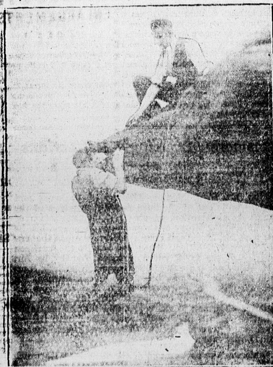
SOME CALL THIS AMUSEMENT

Photo shows: Lieut. Burke, former winner of the King's Cup, seen at Bisle, England.