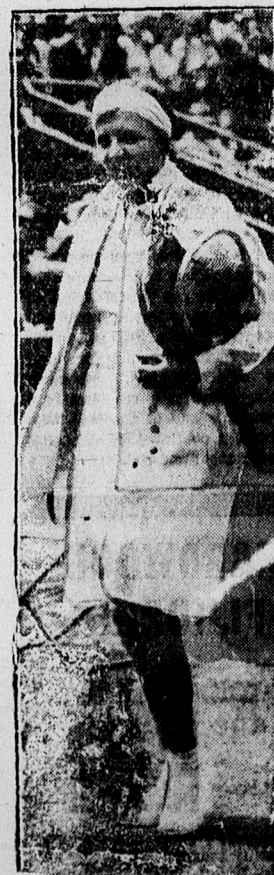
AT WIMBLEDON TOURNAMENT

King Christian of Denmark (LEFT), who disputes Norway's right to claim land in Greenland lying between 75:40 and 71:50 degrees north latitude, and King Haakon VII of Norway (RIGHT), who has officially declared that that part of Eastern Greenland is taken in Norwegian occupation.