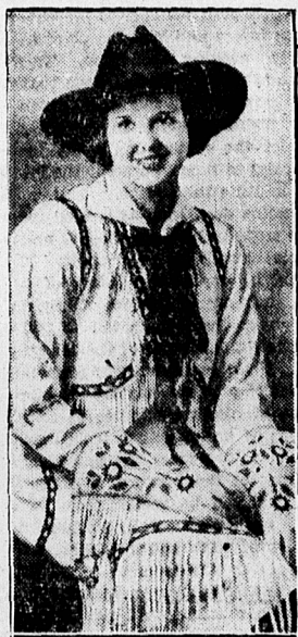
QUEEN OF THE RODEO

Thousands of crickets, breeding in a dump in Swansea, Ont., have infested the homes in the neighborhood, eating clothing, wall paper, curtains and food. Chloride of lime will be used in exterminating the pests. The photograph shows a piece of wall paper eaten by crickets which are also shown. Citizens were puzzled to know how to get rid of the pests which swarmed through their homes by thousands.