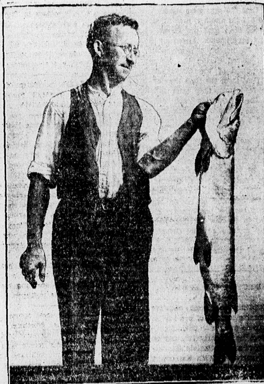
A CHAMPION MUSKIE FISHERMAN