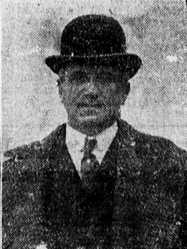
IN DEAL WITH STINNES

High tide this afternoon at 4.46 and tomorrow morning at 6.22. Sun sets this afternoon at 5.02 and rises tomorrow morning at 7.24. Last quarter moon Tuesday, Jan. 29th, 1.53 a. m. Summerside the eighteen minutes later than Charlottetown.