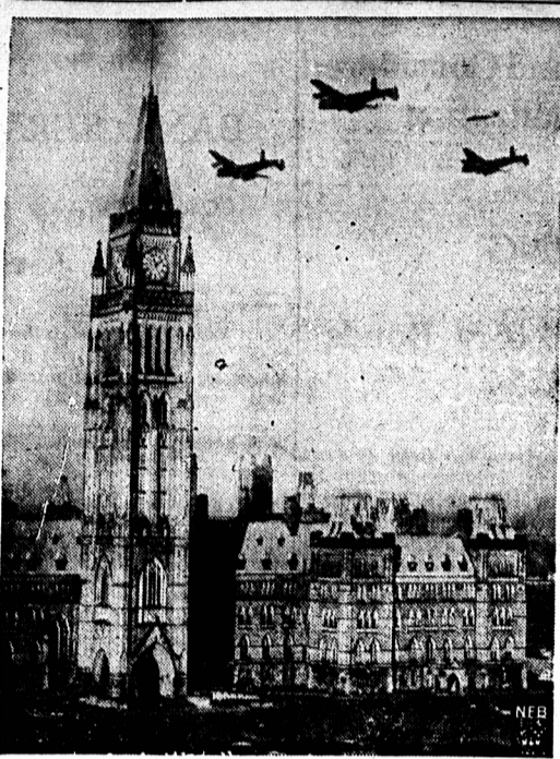
On their way from the government-owned Victory Aircraft, Ltd., plant at Malton, Ont., where they were built, to the ferry command airfield at Dorval, Que., for delivery to England and the war front, three giant Lancaster bombers are pictured above circling Parliament Hill in salute to the Canadian Capital and the federal government buildings. The powerful craft circled over the city several times in formation.