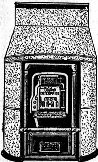
"Most Enterprise Dealers can make arrangements enabling you to buy an Enterprise Furnace by making a down payment with balance in easy instalments."