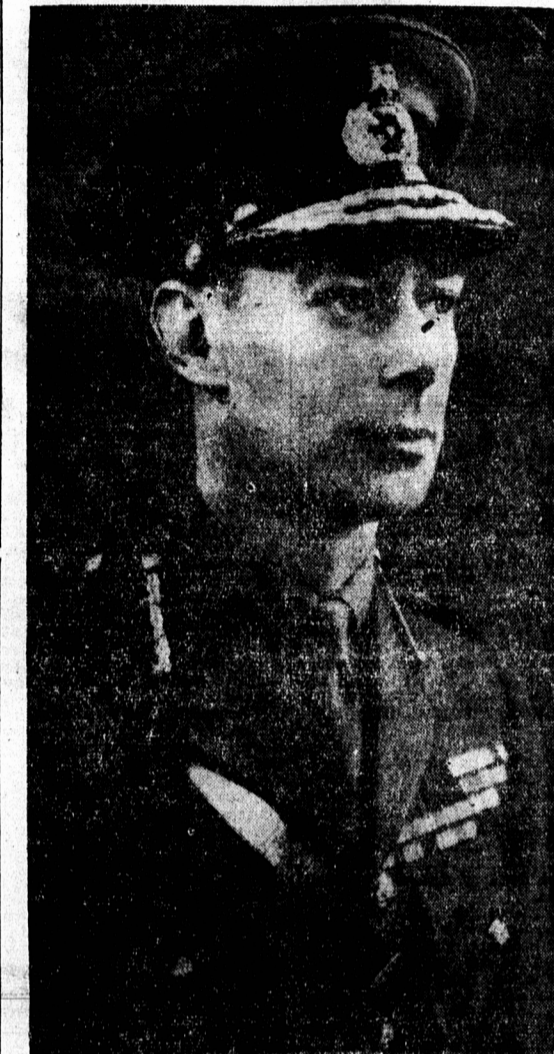
KING GEORGE VI Whose birthday is being celebrated on Monday.

Canada, being United States' best cash customer, the American Government is expected to lend a kindly ear to any suggestion that would save this country from being forced to curtail her purchases from her neighbors because of lack of American dollars.