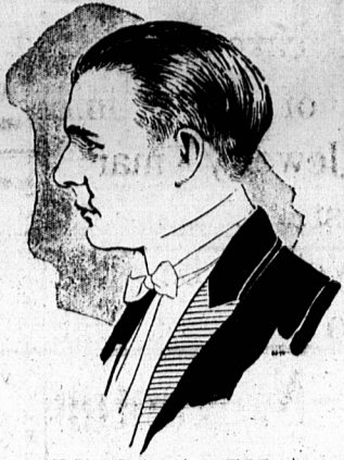
WALLACE REID at 'The Dub' A Grand Game

May be he did look like one. But—this same dub of a kid rescues a girl's fortune from two "shark" brokers, a crooked lawyer and a full-grown burglar. Come and see all the excitement.