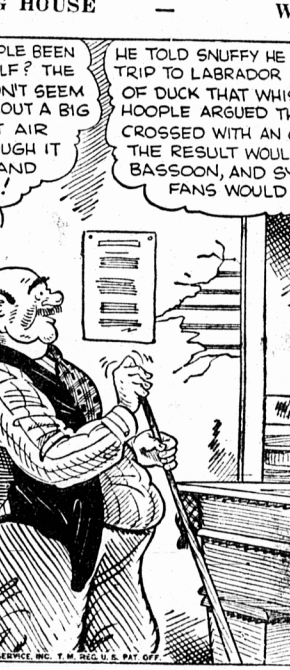
TIPPLE AND "CAP" STUBBS