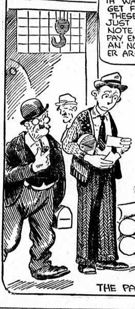
THE PAPER KICK