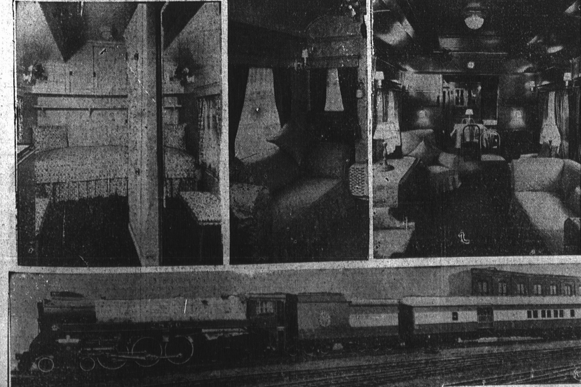
...with the Royal arms emblazoned on the engine tender, the special train which will carry King George and Queen Elizabeth across Canada is pictured here. Spacious quarters for Britain's rulers make the train veritably a "palace on wheels." At right, above, is shown the completely furnished sitting room, with a view of the dining-room seen through the doorway in background. At center, the comfortable divan, wide window and radio provide a pleasant observation post for the royal tourists. The King's bedchamber is pictured at left.