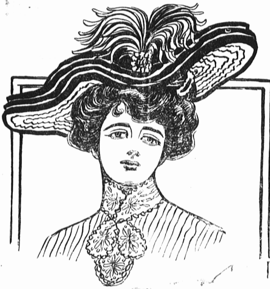
One of the latest, very tall modes for large dress hat. It is of brown panne velvet folds, laid over a light blue shirred mull foundation. A fancy featherette of mixed blue, green and brown adorns the front, dropping well over the broad brim.