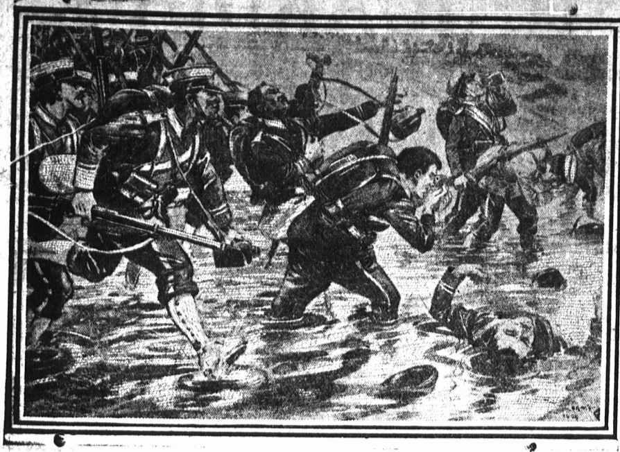
REGIMENT DRINKING UNDER FIRE NEAR HAICHENG.

WANTED—A case of headache that Kumfort Headache Powders will not cure in ten minutes.