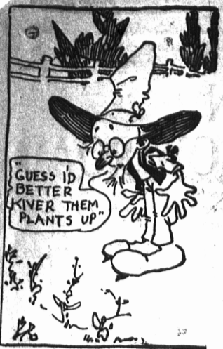
Decidedly cooler, local frosts at night.

WANTED—A case of headache that Kumfort Headache Powders will not cure in ten minutes.