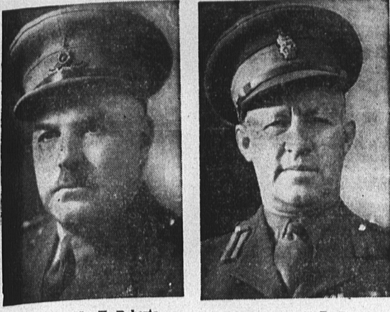
Major-General J. H. Roberts