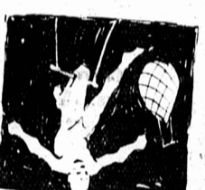
DAILY BALLOON STUNTS

For all classes of livestock poultry, grains and roots, fruit and honey, flowers, natural resources, and for household science, manual training, arts and crafts, school work Indian work, etc.