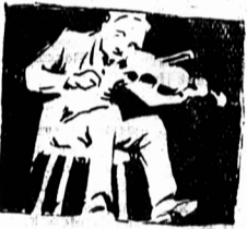
GRAND SACRED CONCERT

With the best horses from Maine and each of the Maritime Provinces entered. Sept. 2, 3, 4. Trotting, pacing and running races.