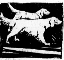
PRIZE DOG SHOW

On Sunday Evening, August 29th. Massed Choir of 140 trained voices in a wonderful musical programme.