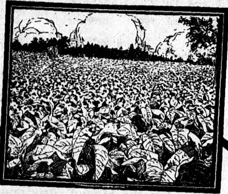
TOBACCO SERIES No. 1

Drawing from an actual photograph of a typical Tobacco field in the "Old Belt" (Virginia and North Carolina).