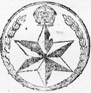
GOVERNMENT OF THE PROVINCE OF ONTARIO

Public works for transportation purposes, already begun, or promised, will cost forty times as much as the Tunnel. We refer to the Transcontinental Railway, the Hudson Bay Railway, the Georgian Bay Canal and the new Welland Canal. There are big things going and we are entitled to our share. Few of these promise any monetary return. The Tunnel promises to save and earn at least the interest on its cost.