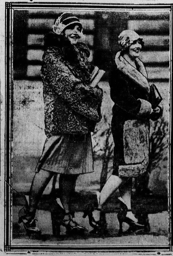
At last there has come into being something, wherewith the fairer sex can combat successfully, sloppily weather, and still keep silk stockings clean and dry as if the sun were shining. These practical splash guards have a decided advantage over bulky galoshes for mild weather.

Money divorced from the moral qualities which would administer it wisely is a curse rather than a blessing. To be moneyless then is not the greatest of evils. When the pope urged the artist to gild the apostle's robes in the fresco he cried "Why! holy father the apostles were poor men!" In spite of their poverty by their faith, love and zeal, the apostles accomplished what they could not have done had they been given a draft in blank on the treasury of an empire. . . . Many men of wealth are doing