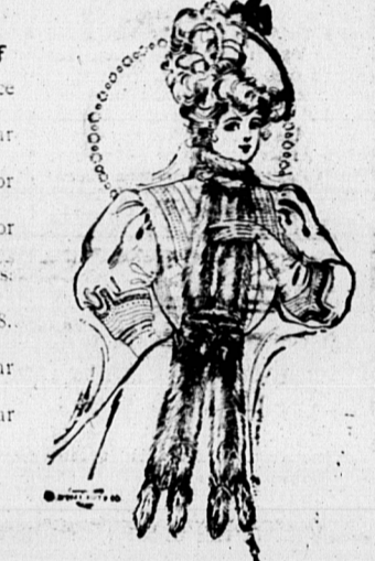
33 1-3 p. c. off all Furs