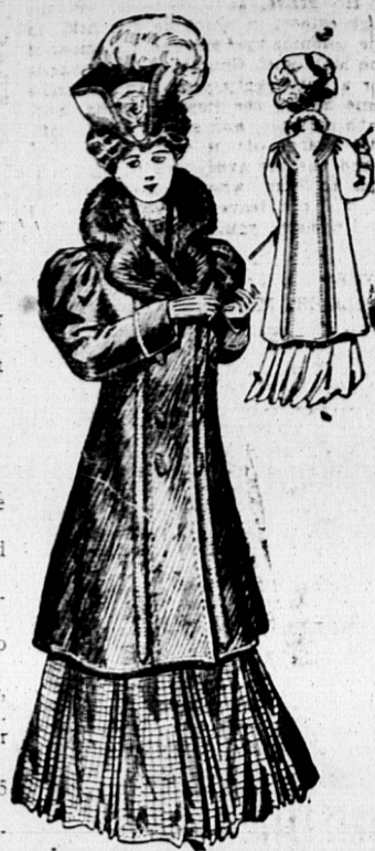
33 1-3 p. c. off all Fur lined Coats