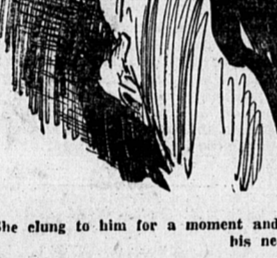
She clung to him for a moment and then her arms went up around his neck

"And I love you," she said very slowly. "You asked me to be honest with you, and that's the truth. I adore you." Her words died to a whisper as she spoke them. He towered above her, and although it was dark, she had memorized everything about him. She put up a fluttering hand and touched the crisp darkness of his hair as it waved back from his broad forehead. Often she had wanted to