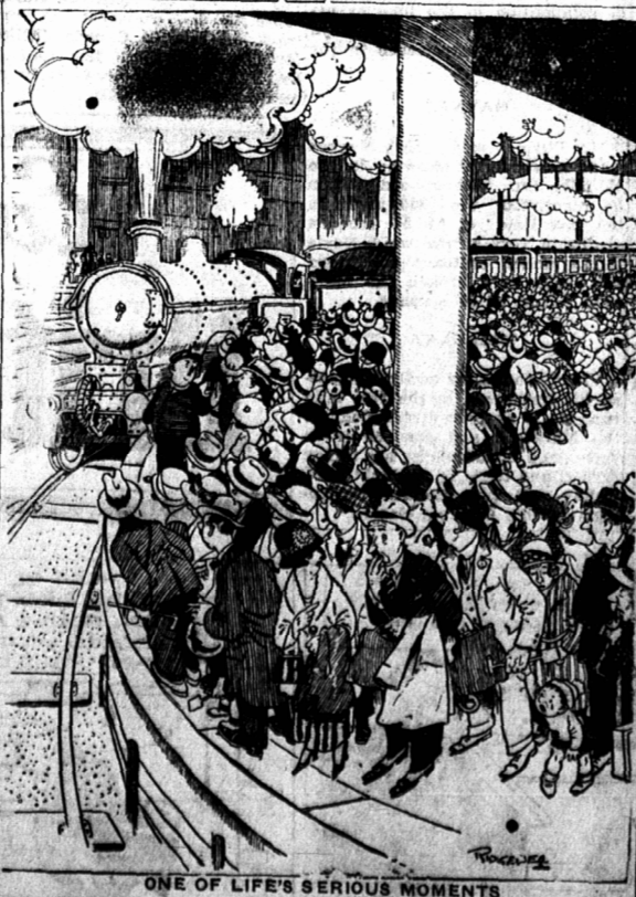
ONE OF LIFE'S SERIOUS MOMENTS

Mrs. Brown (off for holidays): "Are you sure you looked the front door, William?"