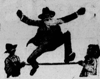
Get That there stuff (Nuxated Iron) acts like magic. It certainly puts the finger of youth into a man.

Former Hospital Physician and Medical Examiner says that in three weeks is Virtually Revitalized His Whole System.