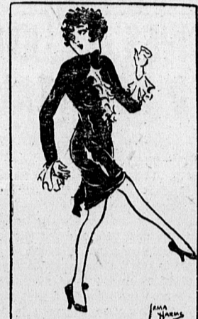
"It isn't always safe to sit in a dress that's supposed to be satin."