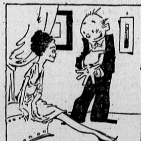
She: Won't it be too cold to sit out in the night? He: We'll be under the cover of darkness, dear.