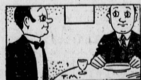
Diner: Will those pancakes be long, waiter? Waiter: No, sir, they'll be round before long.