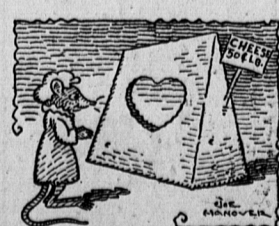
A GREAT IDEA Miss Mouse: How wonderful Willie Mouse is to have gnawed a heart in that piece of cheese and sent it to me for a valentine!