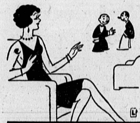
"She nearly perished from exposure." "Who showed her up?"