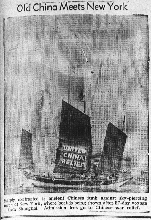
Sharply contrasted is ancient Chinese junk against sky-piercing towers of New York, where boat is being shown after 87-day voyage from Shanghai. Admission fees go to Chinese war relief.