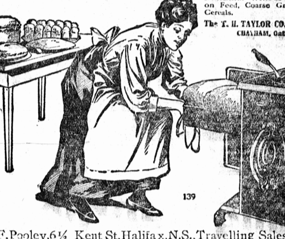
C.F. Pooley, 6 1/2 Kent St., Halifax, N.S., Travelling Sales

Bread, made of "Beaver" Flour, will nourish and sustain you longer than any other one article of diet. Bread, made of "Beaver" Flour, is the least expensive of whole wheat foods. You can eat bread, made of "Beaver" Flour three times longer for a lifetime without wanting a change. It's good for you. "Beaver" is a blended flour. It contains both Ontario and Western wheat, in exact proportions. Your grocer will supply you. Try it.