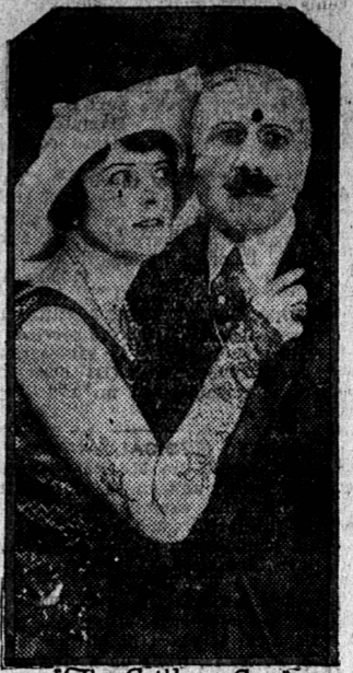
The Caillaux Case WILLIAM FOX PRODUCTION

A Scandal of the World War that electrified the world.