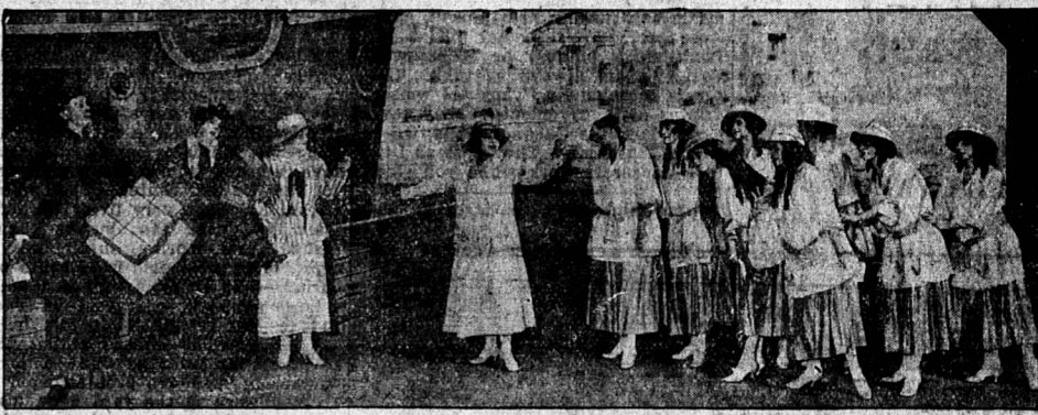
Scene from "My Honolulu Girl" At the Prince Edward Mon. & Tues Oct. 27 and 28.