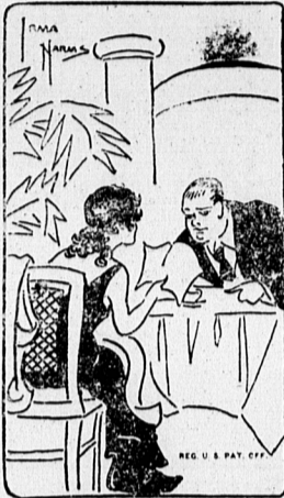
"When you treat a girl to a steak dinner don't talk chop."