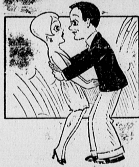
"Won't you consider becoming a life partner of mine?" "How much capital can you put in?"

He married a girl who couldn't cook, and thus his hopes ran high: But, alas; she bought a recipe book And just began to try. Poor chap; She just began to try.