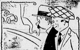
"What do you think is the most difficult thing to learn about running an automobile?" "How to sell it."

First Fan: What is winter? Second Fan: The intermission between seasons.