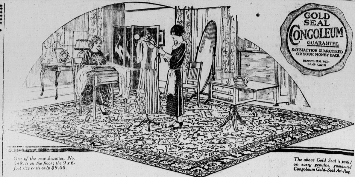
One of the new beauties, No. 549, is on the floor; the 9 x 6-foot size costs only $9.00.

A. D. 1666. The Convent of England was not completed by the Battle of Hastings. The monks were several claimants to the throne, notably Edwin and Morcar, powerful nobles of Northumbria. A beautiful girl was elected. William treated the Saxons mildly with great moderation but for safety erected a stronghold where the Tower of London now stands.