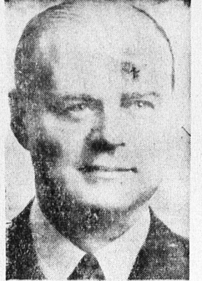
GETS NEW POST

WASHINGTON, Sept. 7—(AP)—The United States Navy Department today disputed Saturday night a claim from Berlin that the destroyer Greer had been the aggressor in an engagement with a German submarine off Iceland. It reiterated that "the initial attack was made by the submarine on the Greer." The navy issued the following statement:— "Notwithstanding German contentions appearing in today's press that the Greer was the aggressor in its action with the submarine, the facts are the same as originally stated by the navy department—namely that the initial attack in this engagement was made by the submarine on the Greer. It was then, and not until then, that the Greer counterattacked." The navy's original announcement Thursday night said that the Greer "in route to Iceland with mail, reported this morning that a submarine attacked her by firing torpedoes which missed their mark. The Greer immediately counterattacked with depth charges." Berlin claimed Saturday that the Greer attacked first and that the U-boat used its torpedo tubes in self defence.