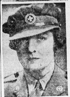
CANADIAN WOMEN SAFE

ATLANTIC CITY, N. J., Sept. 7—(AP)—Lack of panthothenic acid, known as the "acid of life," was tentatively blamed here by the American Chemical Society today for appearance of what was said to be a strange new disease among British soldiers. Soldiers with this new ailment suffered fatigue, breathlessness, fainting spells and disturbance of heartbeat. Belief that it was attributed to lack of panthothenic acid, the little understood fifth member of the vitamin B complex, was expressed in a research report. Principal sources of the vitamins are yeast, molasses, rice hulls and liver.