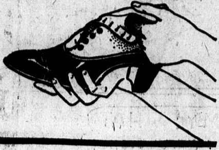
One of the 14

A horrible thing is coarse, brittle, hard leather, and most of it answers to that description. It rubs the tender feet of the gentler sex into blisters, corns, etc. It will almost blister a horse's hoof.