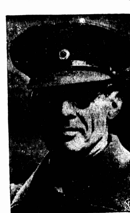
King George VI, right, and Premier Maximos of Greece, left, in a personal message to President Truman last night compared his speech with President Roosevelt's declaration of lend-lease during the war.