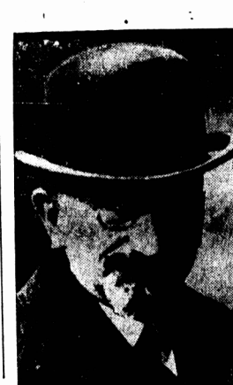
Premier Maximos of Greece, left, and King George, who had said that the United States was the only hope for Greece. They had insisted that the present situation was desperate, and Greek Foreign Minister Constantin Tsaldaris in a personal message to President Truman last night compared his speech with President Roosevelt's declaration of lend-lease during the war.