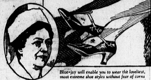
Blue-jay will enable you to wear the loveliest, most extreme shoe styles without fear of corns