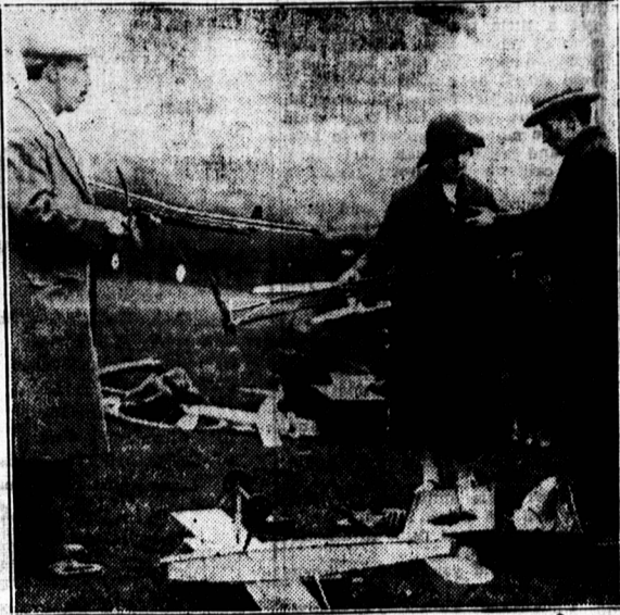
An interesting meeting of the Model Aeronautical Engineers Society was held at Sudbury, where the members competed for cups and trophies.