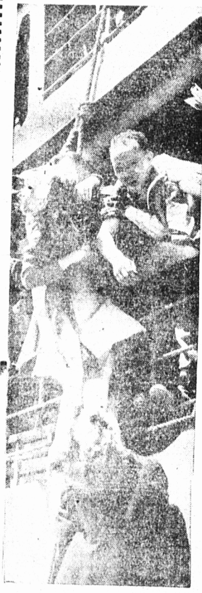
HE GOT ANOTHER ONE

Vivien Leigh and Laurence Olivier, screen stars, appeared in some Toronto movie theatres in aid of the "Stamp Out Hitler" fund. They said they hope to marry in the British Empire, and may pick Toronto for the ceremony. Vivien likes French cooking, says she eats a great deal, but is slim and poised.