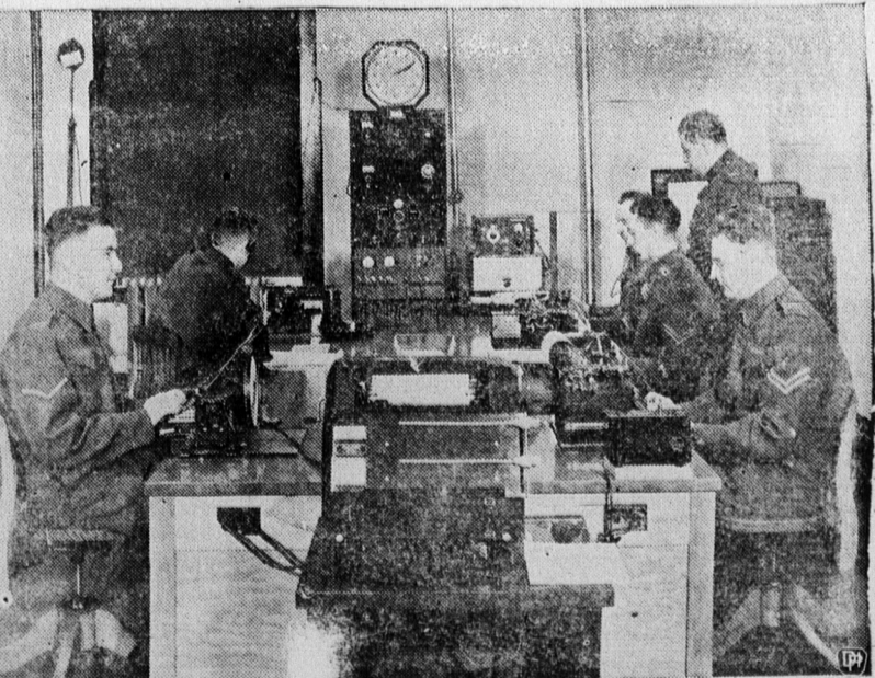
Wireless operators of the Royal Canadian Corps of Signals are shown at work in the Communications Room at Ottawa. From this battery of machines thousands of words are transmitted each day to Canadian Army key points both abroad and in Canada.

STUFFED CURRENCY OLDHAM, England (CP)—Cushions stuffed with $7,650 worth of banknotes were found among belongings of Miss Cecilia Healey Smelters winding up the day with 73 Aldham furs, when she died.