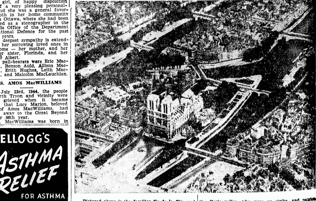
Pictured above is the familiar Ile de la Cite and the famous Notre Dame Cathedral, the scene of fierce street fighting between the French and Nazis. Here the Paris police, who were on strike, and patriots took refuge and turned the site into a fortress against which the Nazi attack broke.