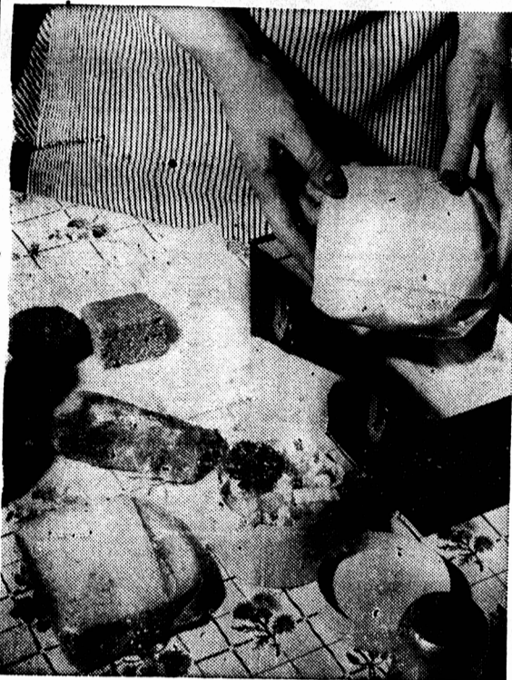
Packing the lunch box has become part of the early morning routine in thousands of Canadian homes now that so many workers in factory and office are carrying their own.

Here is a lunch box that is being packed with energy and vitality as well as good things to eat: sausage roll with a vegetable salad, whole wheat bread and butter, a bran muffin, gingerbread and to round off a lunch that is a meal, not merely a snack, an apple and a thermos of hot cocoa.