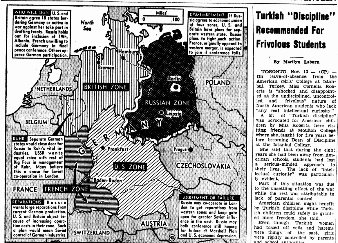
Map highlights some of the controversial angles of the proposed German peace treaty which face the Big Four when they meet in London Nov. 25. The conference will be the second and perhaps final attempt by the Council of Foreign Ministers to chart a united future for defeated Germany.

SECOND SECTION SATURDAY, NOVEMBER 15, 1947 PAGE SEVENTEEN