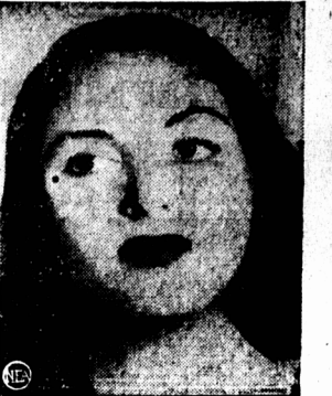
HIGH SEAS MYSTERY

EARLY PAINTING Painting on canvas was known in Rome as early as 65 A.D.