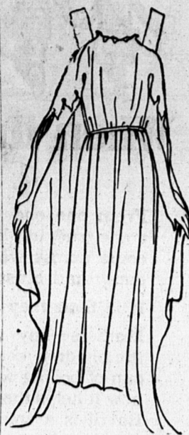
GO INTO FRANCE

This is the fourth day's chapter of the story of Joan of Arc. Follow the adventures of The Maid of Orleans. Soon you will have a whole set of cut-outs with which to act out the story.