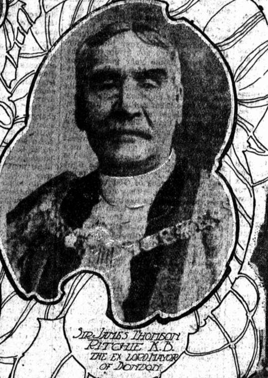
MR. JAMES THOMSON RITCHIE K.C. THE EX-LORD MAYOR OF LONDON