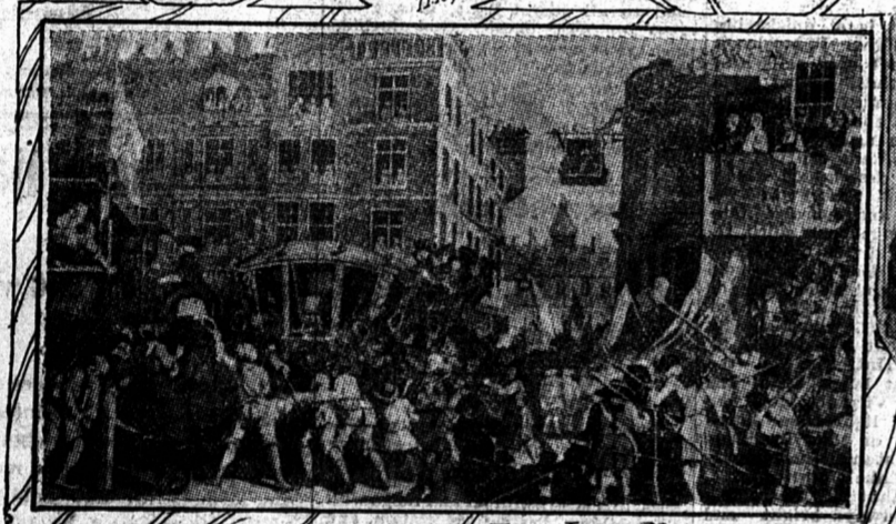
THE LORD MAYOR'S SHOW AS HOGARTH DEPICTED IT