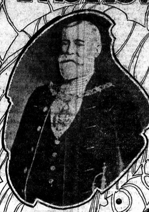
THE NEW LORD MAYOR OF LONDON MR. JOHN POUNT